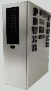
POWER-TOWER V25 with 2,5kWh Storage