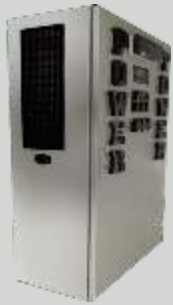
POWER-TOWER V50 with 5,0kWh Storage