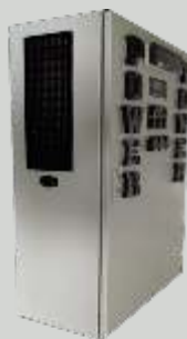
POWER-TOWER V75 with 7,5kWh Storage